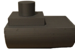
Richly Detailed Toy